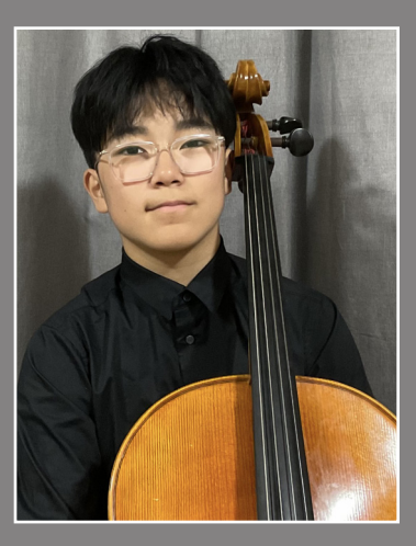
Saturday, November 23, 2024, 7:00 pm

Pre- Concert Talk 6:15 pm. Russel Trip Performance Center, Takena Hall, 6500 Pacific Blvd SW, Albany, OR